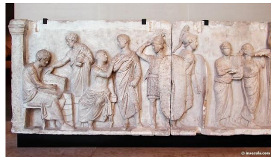
Sculpture (Bas-relief) approx 120-100BC