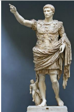
Augustus of Prima Porta statue, c20 BC