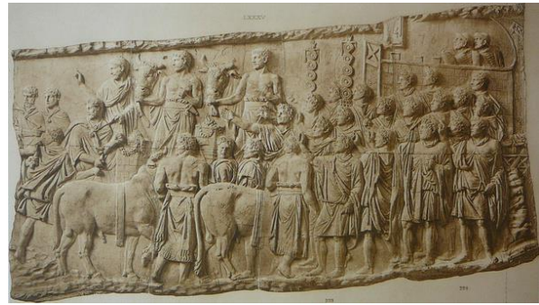
Roman sculpture on Trajan's column showing the raised arm salute to acknowledge the Emperor