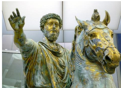
Equestrian Statue of Marcus Aurelius (121-180 AD) in the Musei Capitolini, Rome

It can take several forms and be used as a greeting, in worship or as a military salute. To this day we extend our arms out and wave to greet others or in adoration of monarchies.