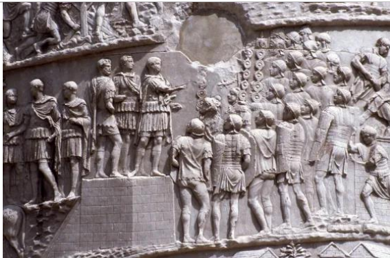
The adlocutio by Trajan with his soldiers (Column of Trajan, Rome)