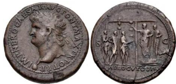
The rear side of a coin of Nero with the raised arm.

Notice, however, that some of these salutes are with a pointed finger or all fingers separated and not together as in the fascist salute. So it is self-evident that the salute appears to have been slightly modified in modern times, but performs the same purposes.