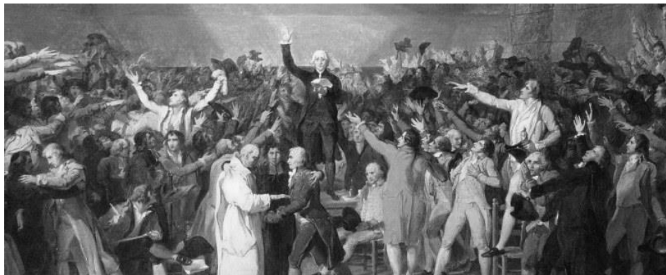
Tennis Court Oath by Jacques-Louis David (1790-94)

While one cannot find the hard evidence to prove it at this time, one wonders if this salute (or a variation thereof) was used in the Holy Roman Empire down through the centuries. It is quite possible.