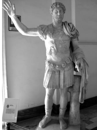
Marcus Aurelius (121-180 AD) statue