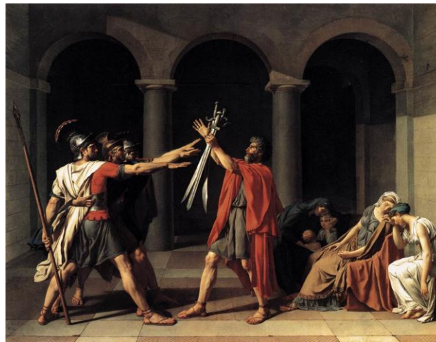
Distribution of the Eagle Standards (1810)

The final painting depicted the moment when Napoleon blessed the standards being held out towards him. Napoleon has his arm raised in imitation of ancient "adlocutio" scenes, which depict Classical heroes addressing troops. David's composition was heavily influenced by the friezes on Trajan's column." [emphasis mine] 9