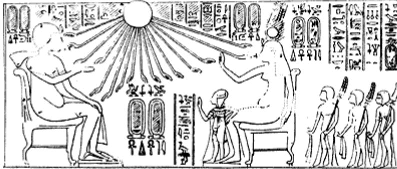
Akhenaten Family Amarna - Mom and daughter salute the king at an informal presentation under the rays of the Aton in one of the famous Amarna paintings

And from the below you can see that it is also portrayed in the Amarna paintings: